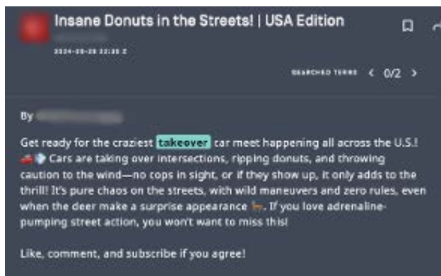
Video of illegal street rally

Local police started with one account name from a communication platform user known to have participated in events. With that account name, investigators were able to identify the main communication platform group where the takeover plans were being distributed. Within that group were more usernames of account holders social media platforms, leading to the discovery of a broader criminal network aligning their activities with these illegal rallies. Even people filming these illegal activities can be charged with crimes.